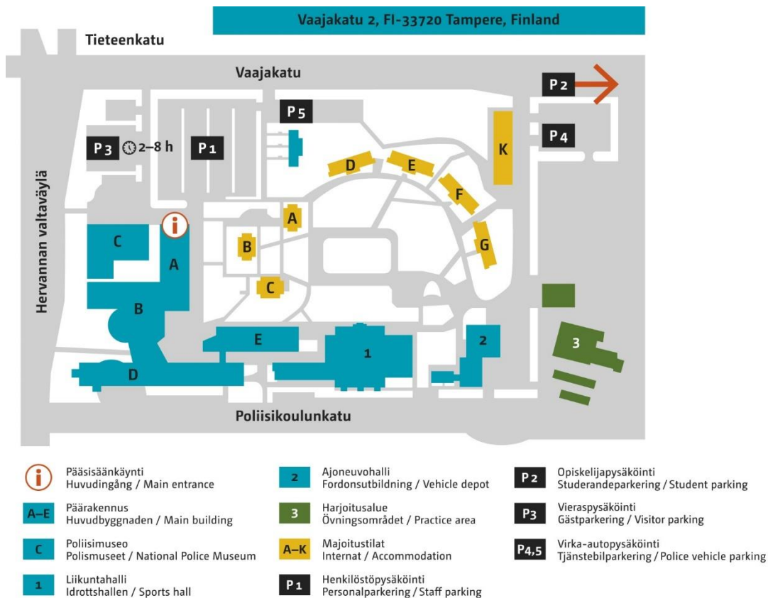
Figure 1 Police University College campus map

On the first day, registration takes place at the reception in the main entrance hall in building A. Enough time should be reserved for registration as everyone's identity is checked.